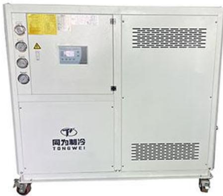
Water-cooled Concrete Batch Scroll Chiller