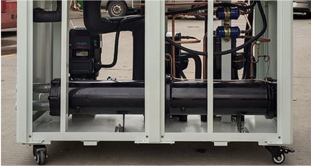
Shell and tube Condenser for water-cooled waterjet cutting chiller

smooth copper tubes, the outer thread embossing process increases the surface area of the copper tubes, thereby expanding the contact area for heat exchange and improving the thermal conductivity of the condenser. This optimization design allows the condenser of the water-cooled chiller to transfer heat from the refrigerant to the water more rapidly and consistently, enabling the water to carry away the heat.