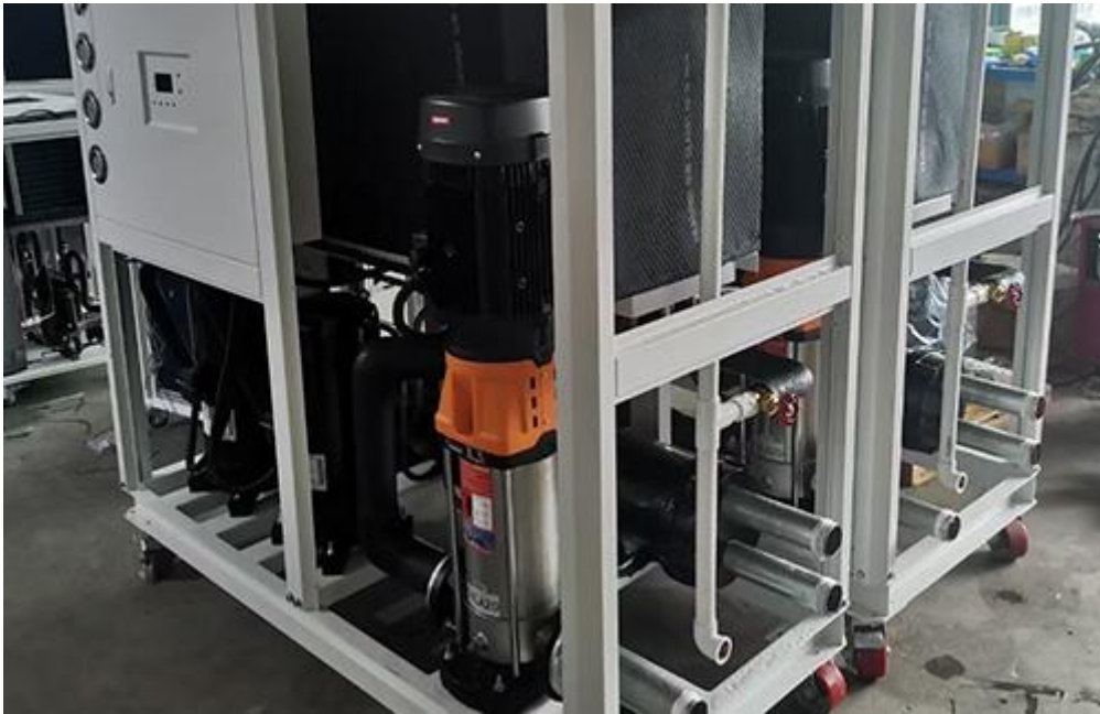
High Pressure Water Pump