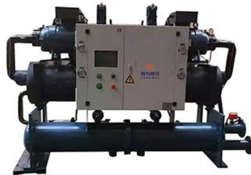
Water-cooled Concrete Batch Screw Chiller