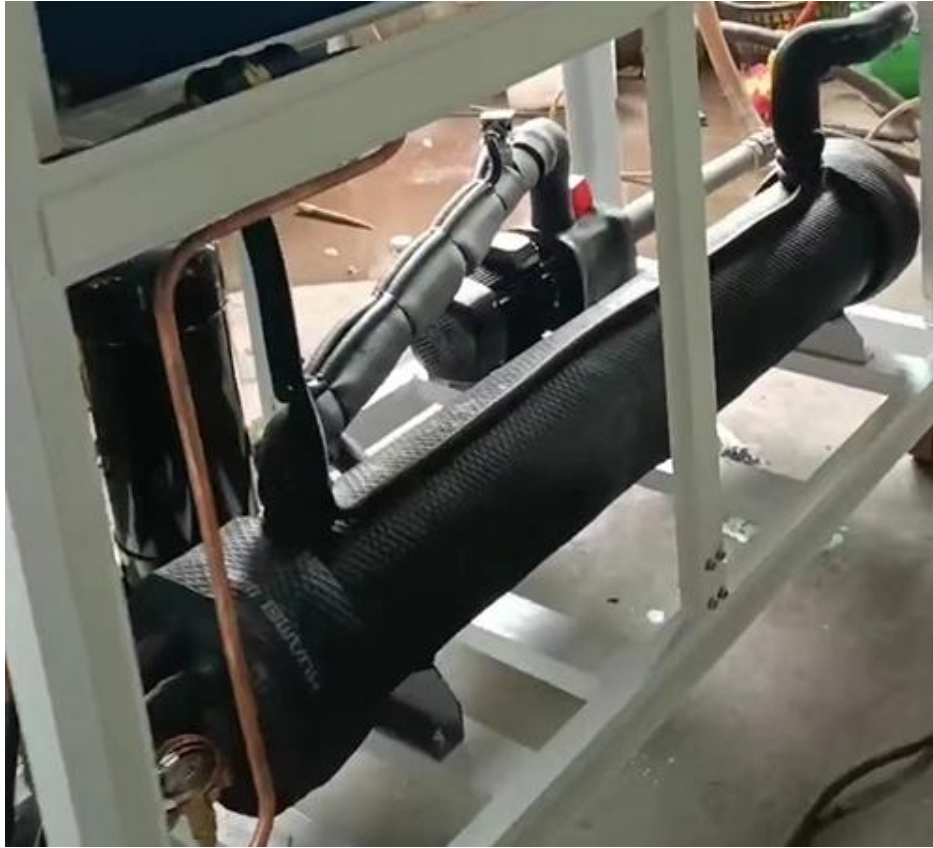
Shell and Tube Evaporator