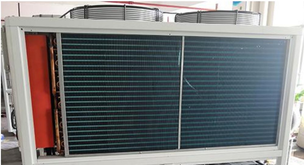
Aluminum fin+fan Condenser for air -cooled Concrete Batch chiller

The condenser for air-cooled Concrete Batch cooler is equipped with efficient cross-seam fins and female threaded copper tubes for high heat exchange efficiency and good stability. Its function is to cool down the refrigerant steam released from the compressor into a liquid or gas-liquid mixture.