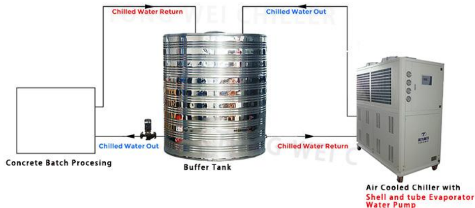
Air-cooled Concrete Batch Chiller Installation Drawing

Water-cooled Concrete Batch chillers use water from an external water cooling tower to dissipate heat from the brewing processes. These systems are longer lifespan, Relatively quiet, and more consistent cooling performance than the air-cooled Concrete Batch chiller.