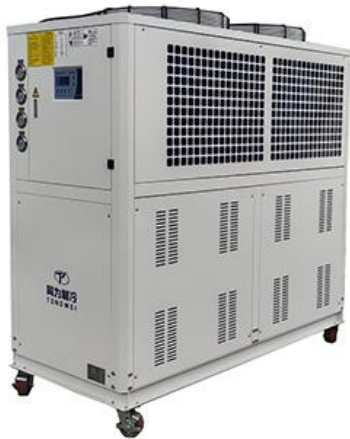
Air-cooled Concrete Batch Scroll Chiller