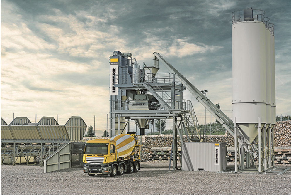
Concrete Batch Processing