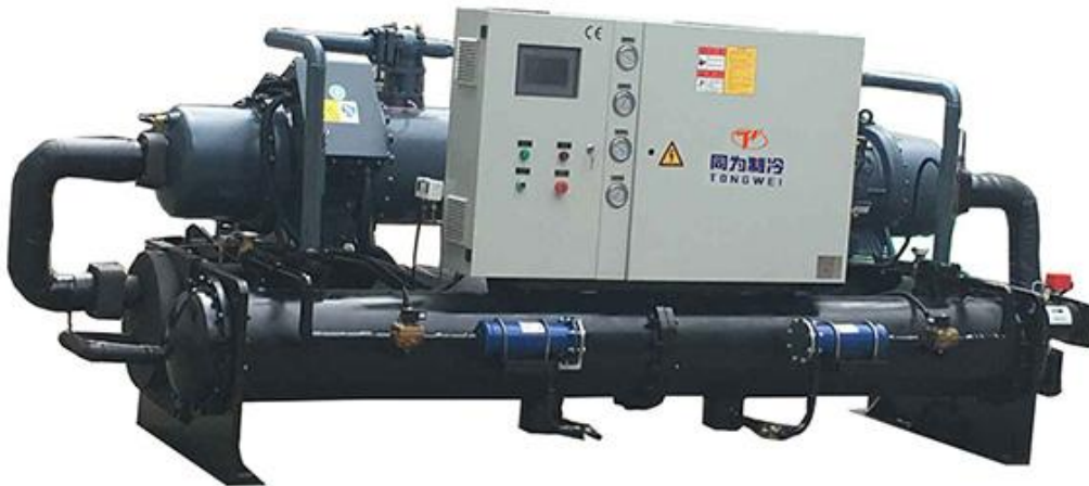
Concrete Batch Chiller