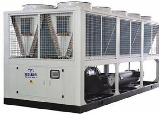
Air-cooled Concrete Batch Screw Chiller